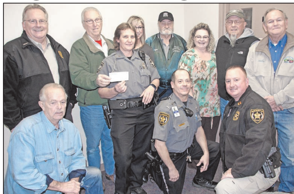
The Blairsville Cruisers dropping off a donation at the Union County Sheriff's Office.

Cruisers spend a good part of the year raising money for local charitable efforts with their ever-popular annual car raffle, plus their Cruise-In sponsors and food sales.