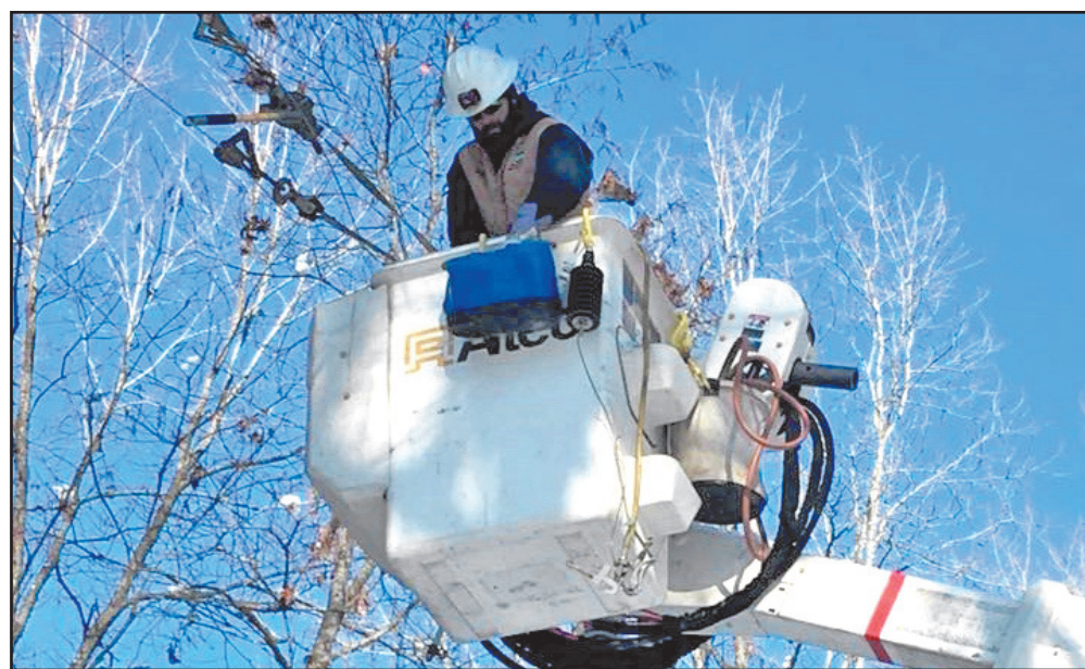
A Blue Ridge Mountain EMC line worker getting power back on for residents. Winter Storm Benji left thousands without power over the weekend.