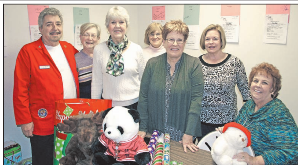
Volunteers with the "Foster Children's Christmas Program," during the 2016 Christmas season.